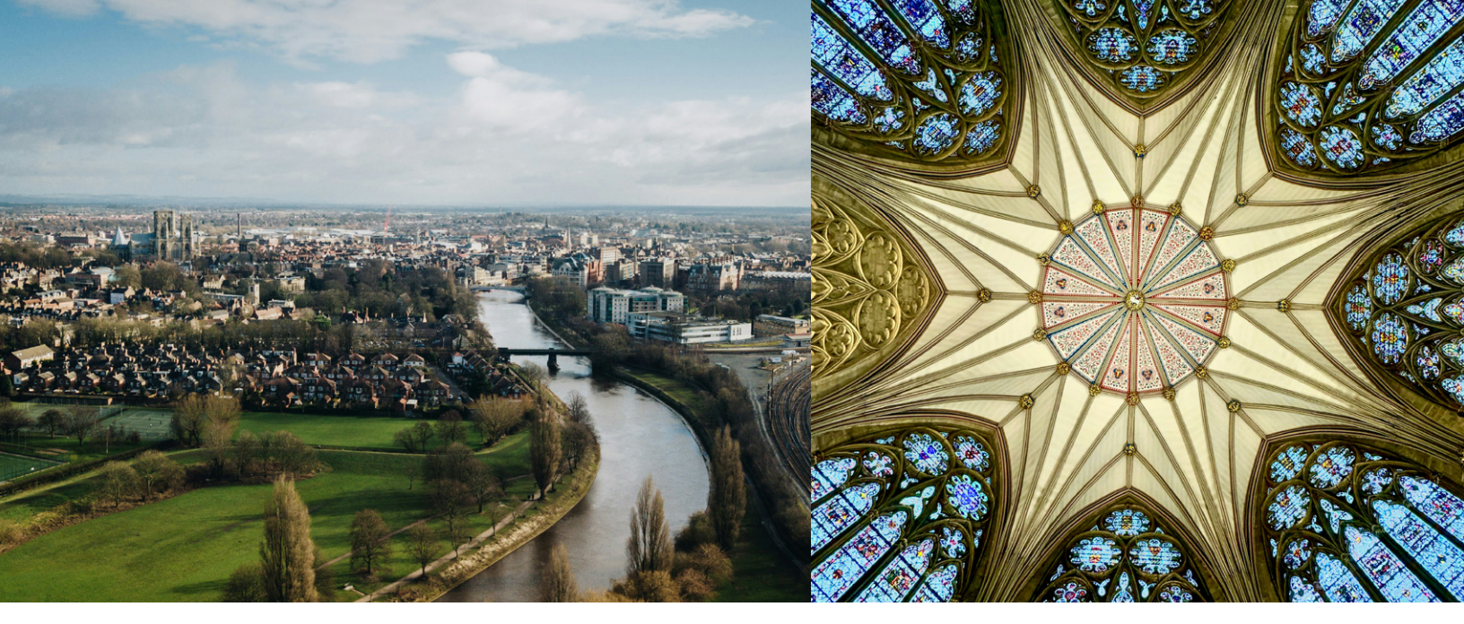
PREVIOUS PAGE: 1. MEDIEVAL CHESTER 2. RIEVAULX ABBEY 3. YORK MINSTER CATHEDRAL 4. HAWORTH MOOR, YORKSHIRE 5. GUARD CROSSING, LONDON ABOVE (LEFT TO RIGHT): AEREAL VIEW OF YORK / CEILING DETAIL AT YORK MINSTER CATHEDRAL